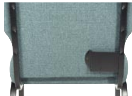
METAL CARD POCKET