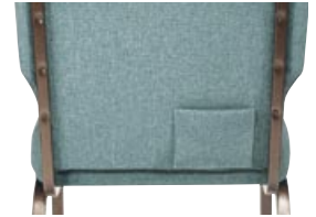
SMALL CARD POCKET