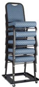
4 WHEEL DOLLY