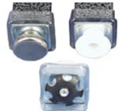
METAL & VINYL FOOT GLIDES