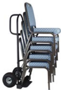
2 WHEEL HAND TRUCK