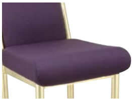
BOLSTER SEAT UPGRADE