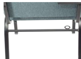
COMMUNION CUP HOLDER