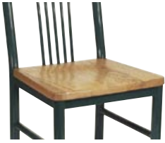
OAK WOOD SEAT

Hospitality Restaurant Institutional Worship Centers Health Care