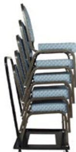
4 WHEEL HANDLE DOLLY