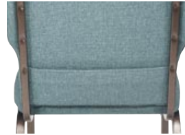
FULL WIDTH CARD POCKET