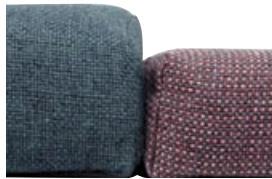
CUSHION THICKNESS UPGRADE