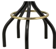
BRASS SWIVEL FOOT RING